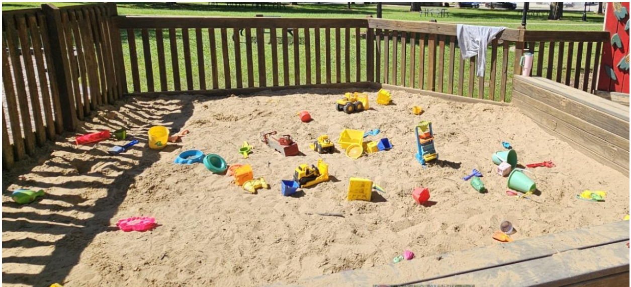
Rake and clean out the sandbox and more sand