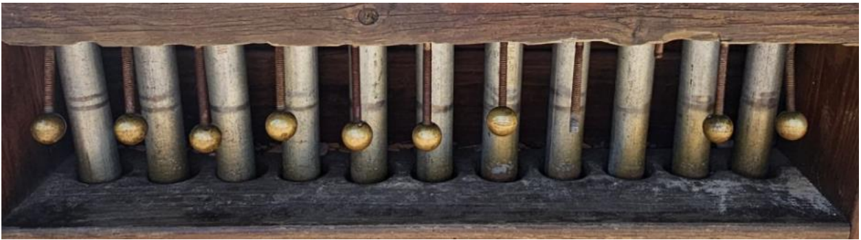
Fix or replace the missing bell chimes