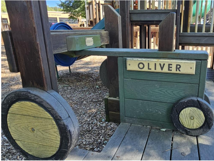
Repaint the tractor