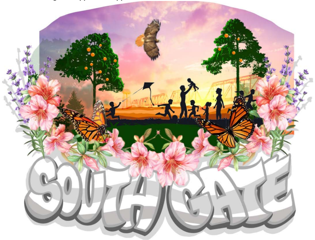
Final Mural Design for Approval – approx. dimensions 30'x60'