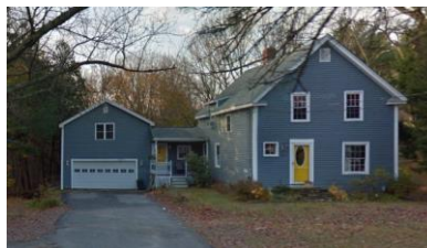
X:\COMMUNITY DEVELOPMENT\PLANNER\COUNCIL\MATERIALS\VILLAGEDESIGNSTANDARDS2023\VILLAGE CENTER DESIGN STANDARDS.2023.PARKINGUPDATE.DOCX 5