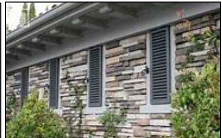
Clockwise from top: Brick façade; pitched roof with appropriate colors and stone wainscoting; decorative canopy; faux windows with stone brick façade; overhang canopy; dormer.