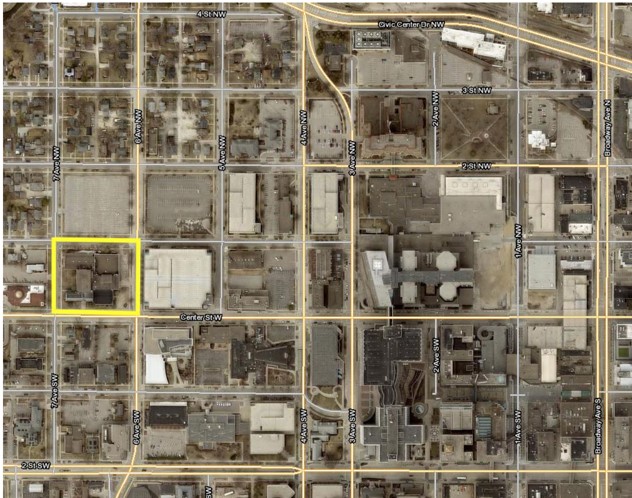
Old Lourdes High School location, Olmsted County GIS ii