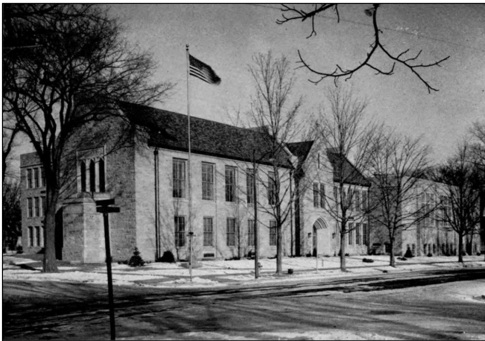
Lourdes High School, 1945