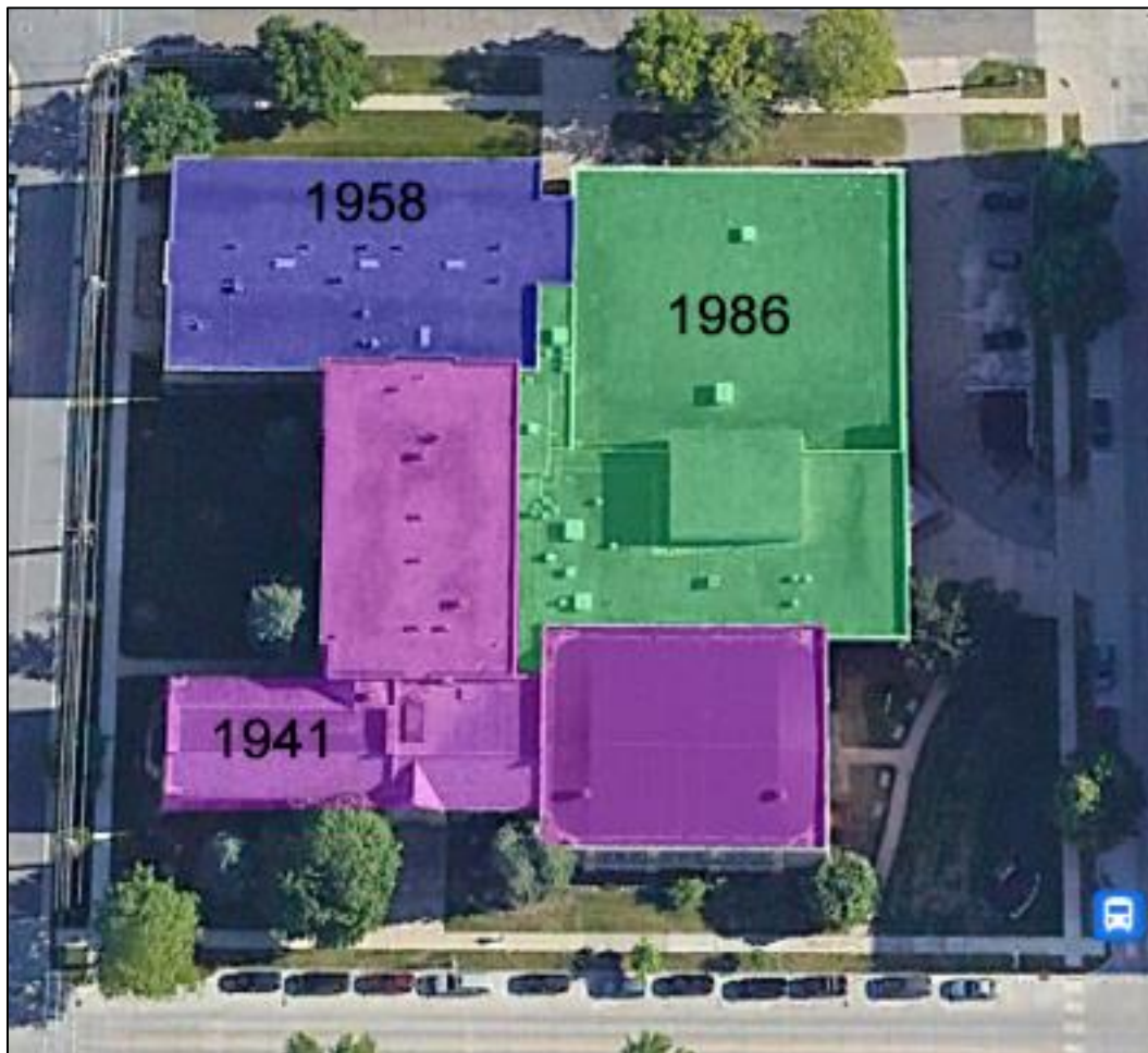
Map of Lourdes High School showing building years

Each building section is typified by a central corridor with classrooms and offices on either side. The 1941 section also holds a library, chapel, gymnasium, and auditorium. The 1958 addition is entirely classroom space. The 1986 section houses a larger gymnasium and administrative offices as well as classrooms. The building was finished with tile, wood, carpet, and vinyl flooring. Decorative plasterwork is extant in the 1941 building.