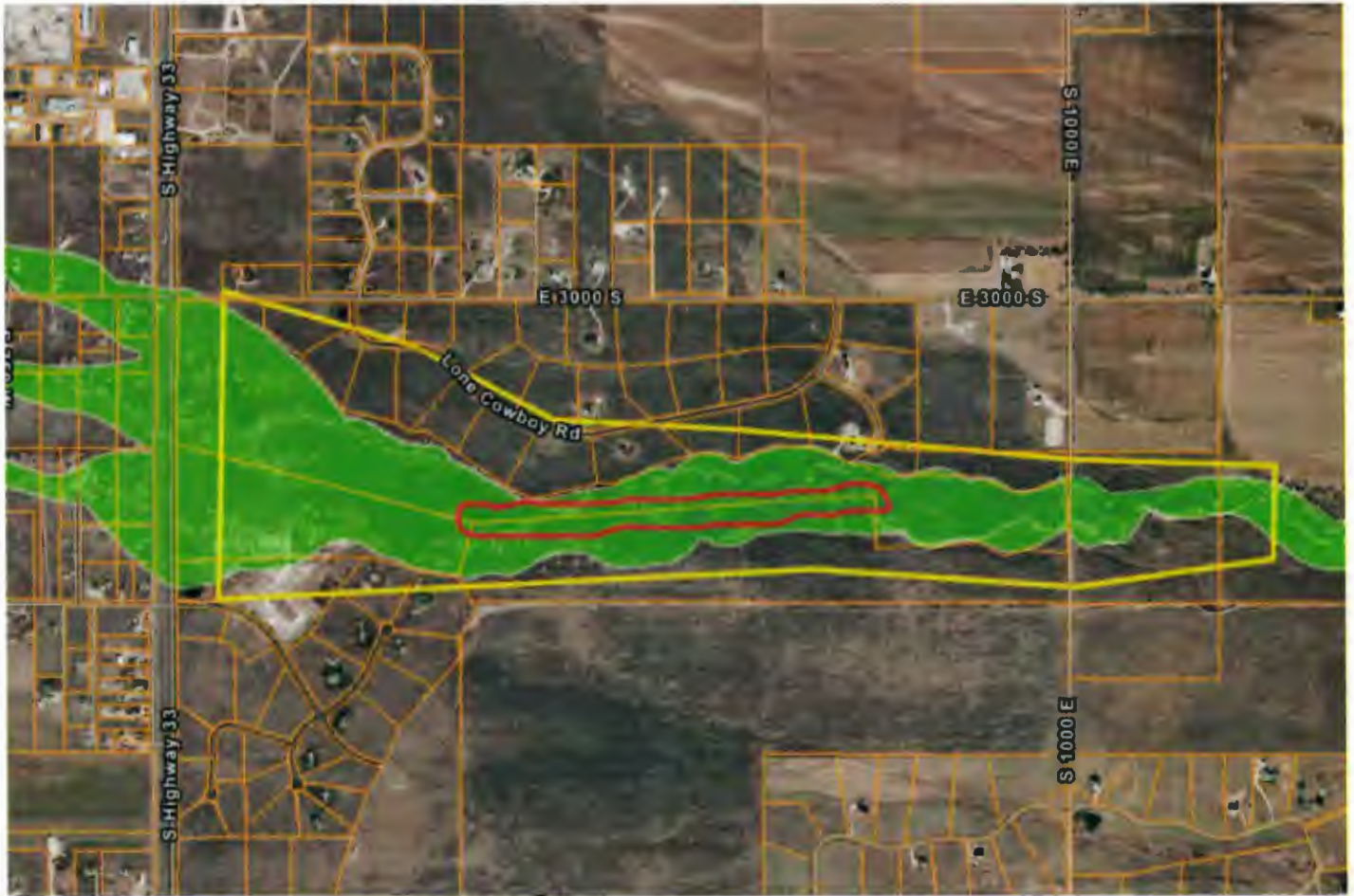
Darby Creek Area of Disturbance: (Red Line=Approximate Area of Disturbance; Green Shading=Effective FEMA Floodplain Map Zone A)