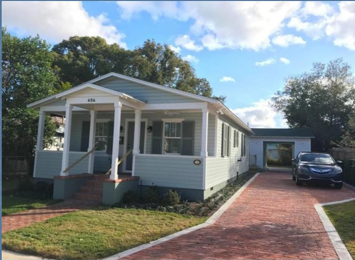
654 W LYMAN AVE, WINTER PARK, FL 32789 1/22/2019 3:31 PM